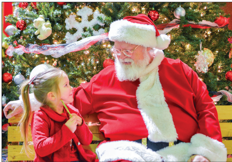
A young guest speaks to Santa Claus during Holiday in New Mexico inside the Gurley Hall Commons at The University of New Mexico-Gallup on Dec. 5, 2024.

A giant Christmas tree glistened in the middle of