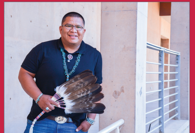
Honoring culture with art Page 7