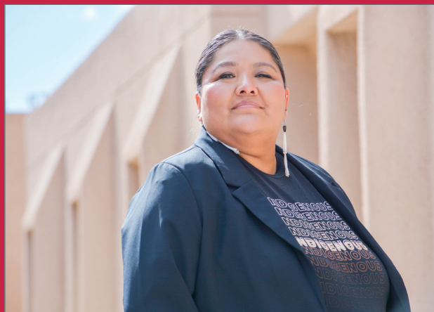
Serving Indigenous students Page 5