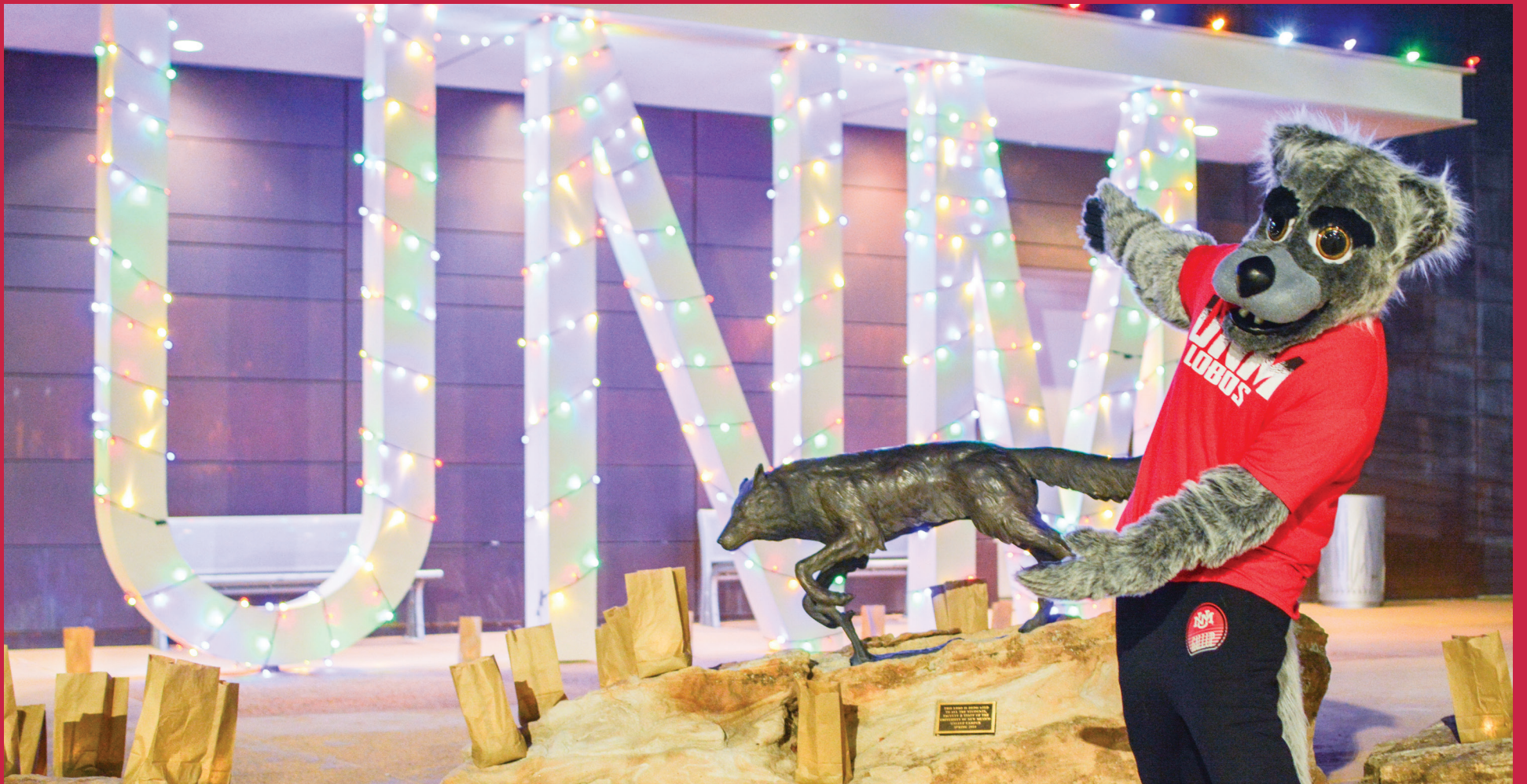
UNM mascot Lobo Louie showcases the luminarias and colorful string lights that decorate the patio outside the Student Services & Technology Center during Holiday in New Mexico at The University of New Mexico-Gallup on Dec. 5, 2024.