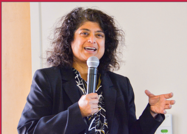
Building stronger together Page 3