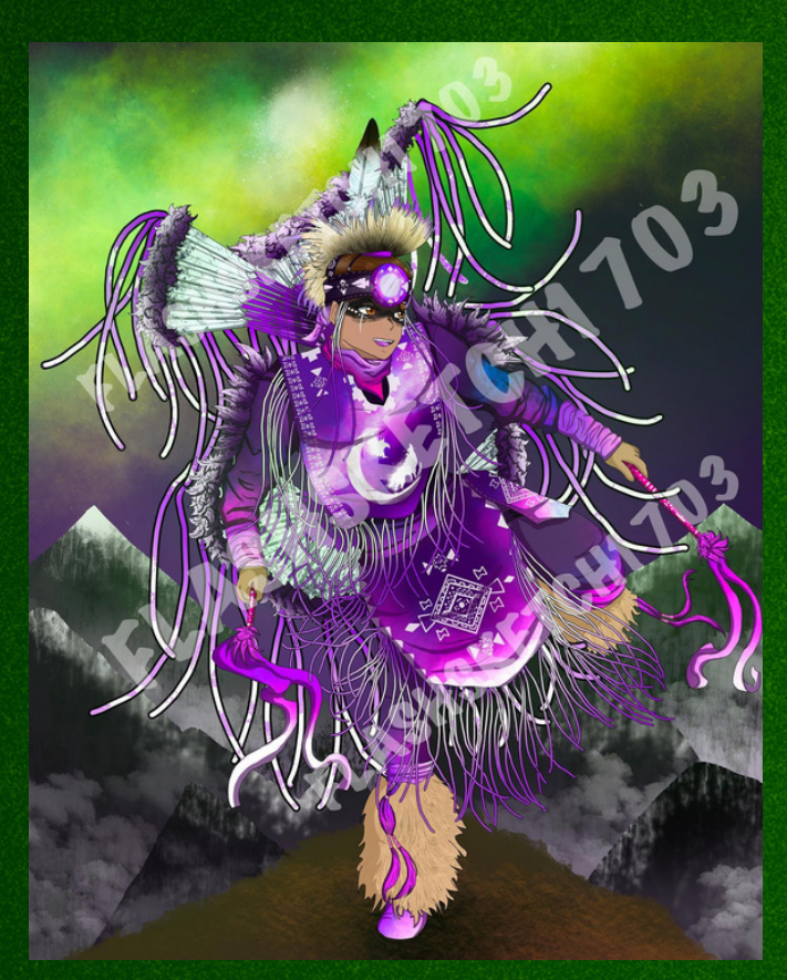
Another digital art created by Tehyonna.