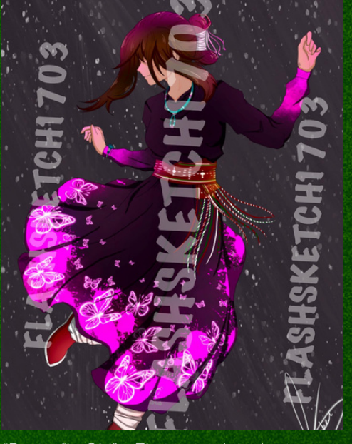
done on a Note 9 phone, one of

story about "Spider Lady". These Native stories are another Tehyonna's most proud of.