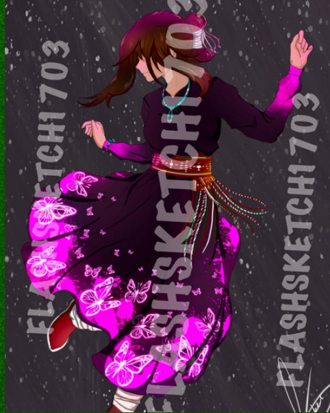
"Butterfly Girl" - First completed art done on a Note 9 phone, one of Tehyonna's most proud of.