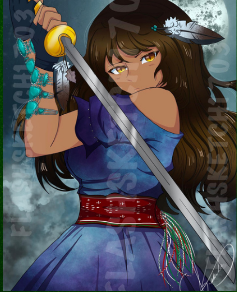
Navajo woman warrior inspired by a Navajo story.