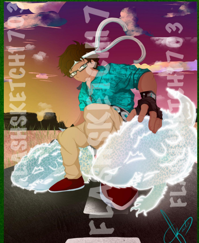
Another digital art created by Tehyonna.