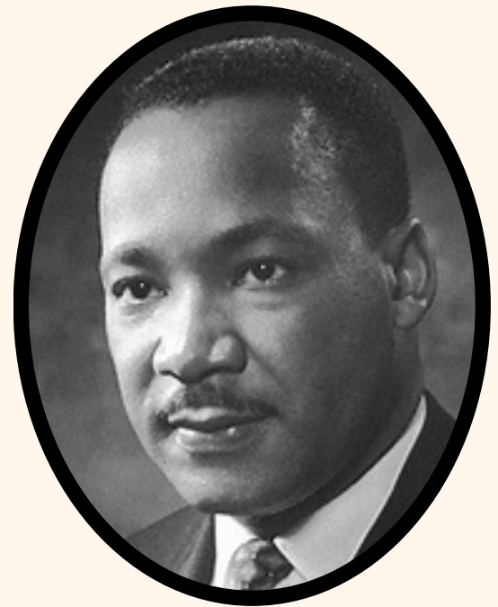
Martin Luther King Jr.

Martin Luther King Jr. graduated from high school at fifteen years old. In 1948, he then earned his B. A. degree and B. D. degree in 1951. Eventually, he graduated with his Doctorate in 1955.